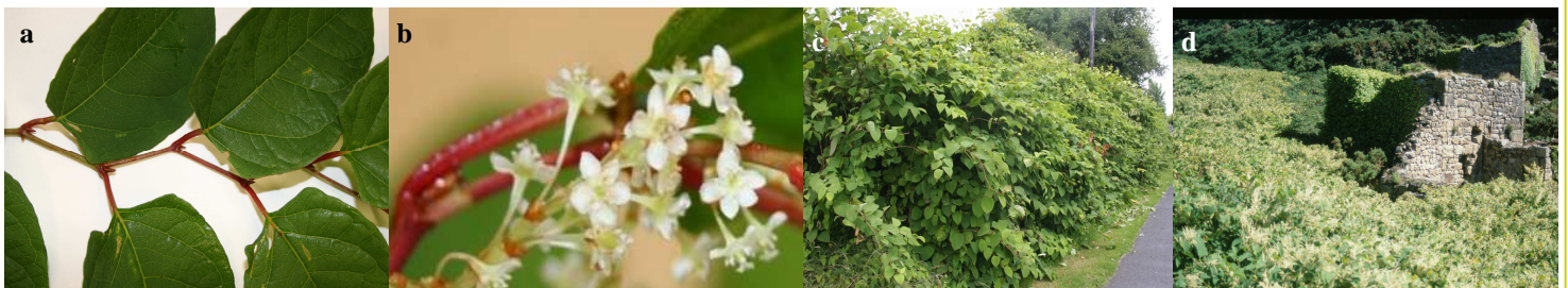
Japanese knotweed.

If charged with any offence under these Regulations it must be proven in defence that the accused took 'all reasonable steps and exercised due diligence to avoid committing the offence'.