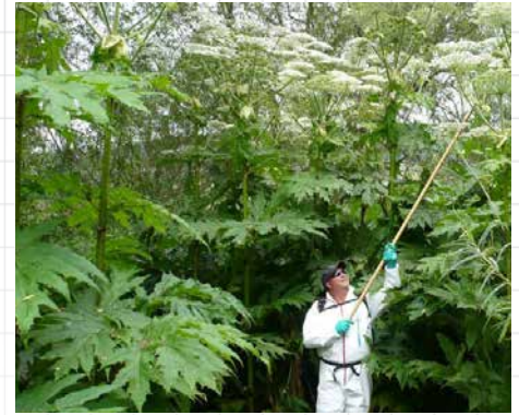
Spraying of giant hogweed