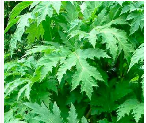
Giant hogweed