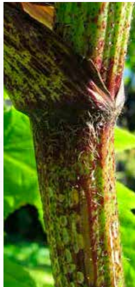
Stem can be 5-10cm in diameter