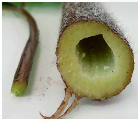
Cross section comparison of a hogweed (left) and giant hogweed (right)