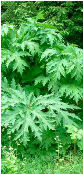
Deeply serrated and large leaves