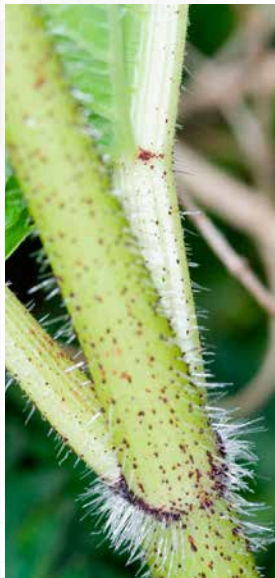
Hairy bristles on stem