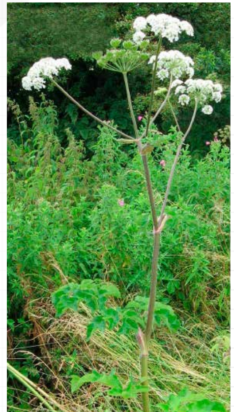
Hogweed, which is a native plant